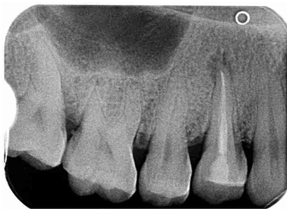
Figure 3: Immediate post operative image

Root canal treatment was carried out and completed after which the symptoms resolved completely in 3 weeks' time.