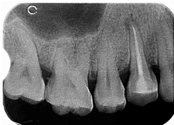
3 months follow-up