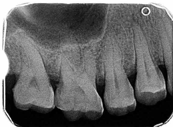
Figure 1: Radiograph at the time of presentation

Radiographic examination revealed no abnormal findings; the lamina dura of the teeth in question was intact with adequate crestal bone levels. However, some calculus spurs were identified.