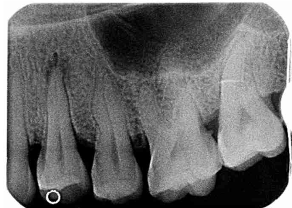
Figure 3: Periapical radiograph 4 months after initial presentation

The patient did not return for a follow-up until December 2011 with acute pain in her right maxillary first premolar area. She reported of worsening symptoms during the past four months with a decrease in her chewing efficiency on the affected side for which she was on multiple courses of antibiotics advised by her ENT and general physician. Periapical radiograph was repeated of tooth #13, 14 and 15 and an apical radiolucency with tooth #14 was evident (Figure 3). The tooth was acutely tender to palpation, thermal testing